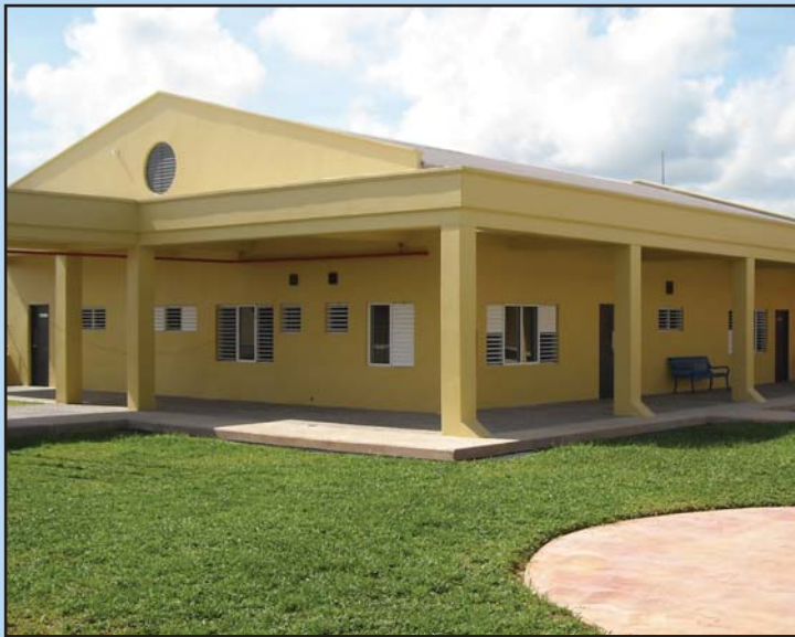
St Marys Government Primary - Exterior