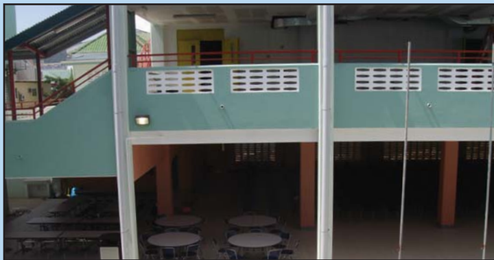
Tranquillity Government Primary - Exterior

generations of the significance of that date in their school community and of the promise to future schoolchildren of Moruga. Their newly networked computers will serve to expand learning opportunities beyond the limits of their town and into the global community.